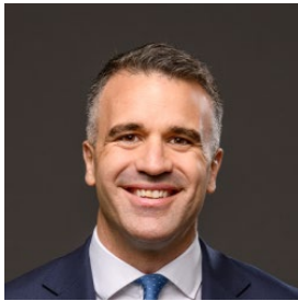
Hon Peter Malinauskas MP Premier of South Australia